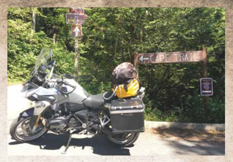
Seattle. Fortunately, I am on it for less than 30 miles and in just over 3 hours I am pointed due North on the 101 towards Olympic National Park.

I'm in no rush since my entire route around the Olympic Peninsula is less than 300 miles. I enjoy hiking through the rain forest and walking down to several beaches, even safely passing through the vampire laden Forks, Washington. I finally arrive at the Makah Indian Reservation. Navigating from a good old-fashioned paper map, it seems I can truly ride no further northwest. I park the bike and after a short 30-minute walk on a trail impeccably maintained by the reservation, I arrive at the Cape Flattery Light House overlook. As I look across the Straight of Juan De Fuca, the international boundary between the US and the "The Great White North" I wonder if there is any possibility of accessing the 20-acre Tatoosh Island. At ½ mile off the US coastline it is officially the northwestern most lighthouse on the west coast of the contiguous United States. The islands "westof-me" location taunts me as I watch speedboats wiz between the mainland and the namesake of Chief Tatooche. However, because it is not contiguous I feel I can accept my position at approximately W124° 42' 52 longitude as close enough to the furthest point west in the contiguous U.S. I smile take one more photo of the lighthouse and return to my bike.